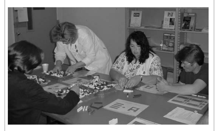
Pharmacy workers at South Side Hospital work with Legos to describe how systems now exist—and how they could change and improve.

With a learning line, that specific piece of data—Mrs.