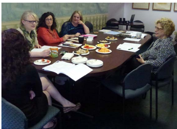
As part of National Healthcare Decisions Day on April 16, JHF staff hold “office hours” to discuss advance care planning and end-of-life treatment with their colleagues.

National Healthcare Decisions Day provides a platform for individuals to discuss and document their end-of-life care preferences with loved ones and medical professionals. JHF promotes advance care planning and end-of-life conversations year-round through its Closure education, planning, and outreach program, leadership of the Coalition for Quality at the End of Life (CQEL), and educator role in the RAVEN skilled nursing initiative. But on April 16, Foundation staff devoted time to help their colleagues engage in