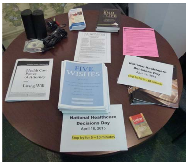
From brochures to creative nonfiction to Physician Orders for Life-Sustaining Treatment forms, JHF staff offered a variety of resources to stimulate care planning discussions.