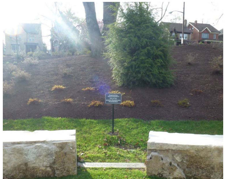
JHF’s support of the “Keeping Tabs” initiative includes a gathering space for visitors to the memorial.