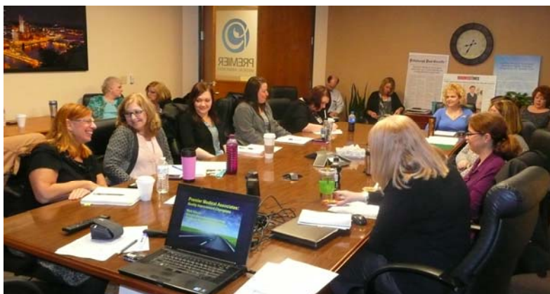
PRHI facilitates a quality improvement workshop at Premier Medical Associates in April of 2015.