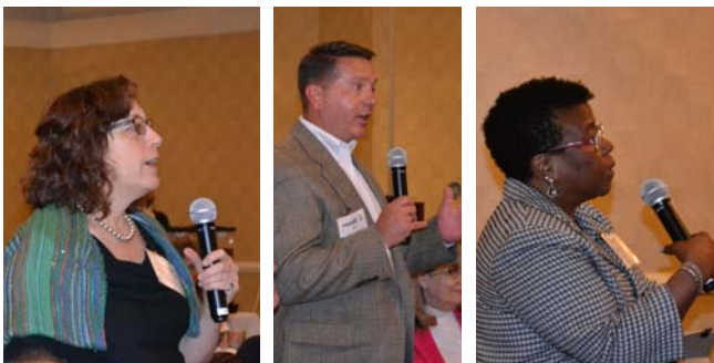
A very engaged audience took the opportunity to ask lots of questions of our panelists, responders, and moderators.