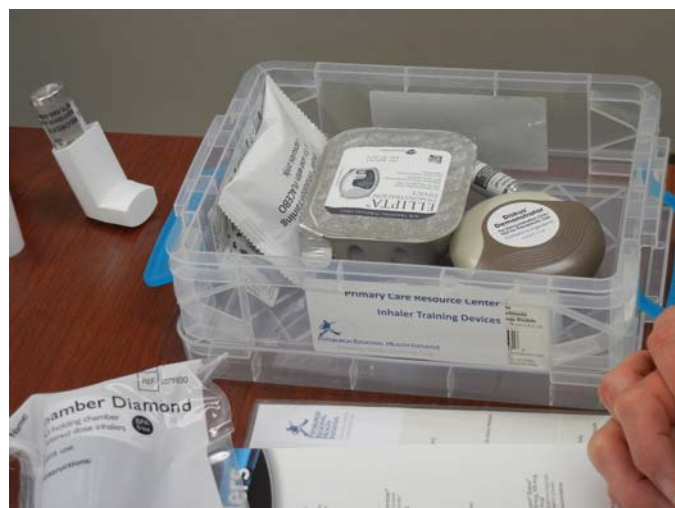
As part of PRHI's new inhaler training course, more than 30 nurses, pharmacists, and respiratory therapists received a kit of placebo inhalers so their patients are comfortable using the devices before discharge.