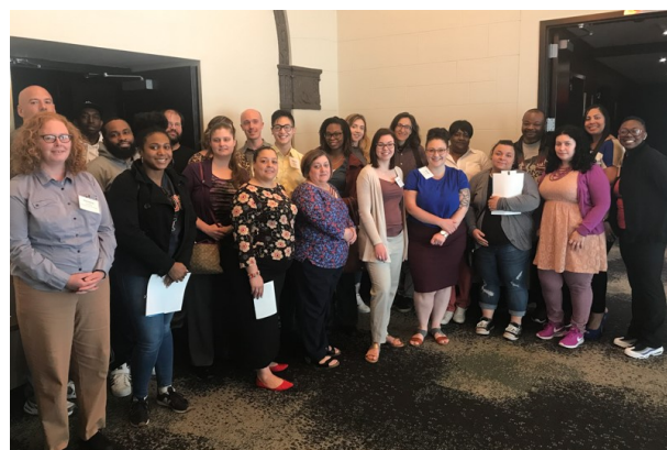
Participants in the Minority AIDS Initiative Learning Session in Philadelphia.