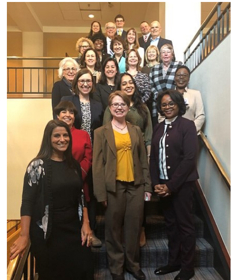
Members of the Pennsylvania Health Funders Collaborative in Harrisburg.

Social Determinants of Health. As much as 70% of health care costs are driven by factors such as food and housing insecurity, physical violence, and poor transportation. These social