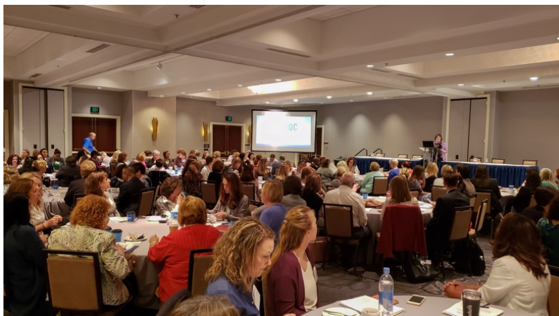
The capacity crowd at the first learning collaborative of the PA PQC.