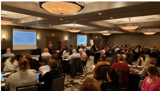
The Learning Network session for Opioid Use Disorder Centers of Excellence.

PRHI and the University of Pittsburgh's School of Pharmacy's Program Evaluation and Research Unit (PERU) held a Learning Network session on April 17 for the 45 Opioid Use Disorder (OUD) Centers of Excellence (COEs) in the Commonwealth. During the Harrisburg session, the COEs identified best practices from other COEs to inform their work, learned strategies to support peer specialists and Certified Recovery Specialists on their community-based care management teams, and identified strategies for engaging and retaining clients with OUD in treatment and comprehensive services.