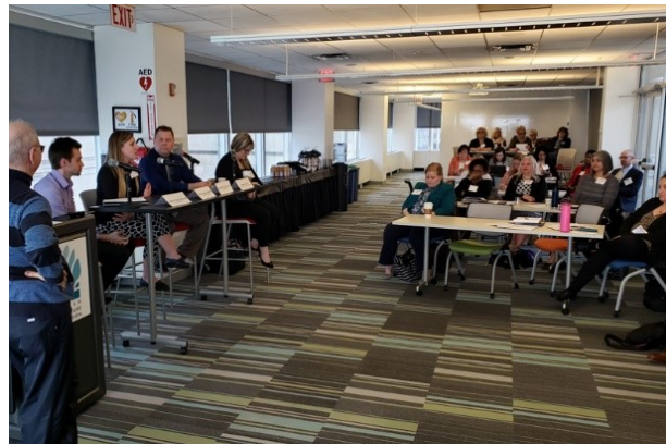
The PCMH Learning Network session in the QI 2 T Center.

The Health Federation of Philadelphia (HFP), PRHI's partner in the effort, will run the May programs in the Lehigh/Capital area and the Southeast.