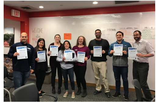
JCC and Friendship Circle staff at training in Youth Mental Health First Aid.

On April 22 and 30, the JCC and Friendship Circle held staff training in Youth Mental Health First Aid, a national course to prepare professionals to be early responders to the mental health needs of youth. Eight JCC staff, including staff and leadership of the Emma Kaufmann Overnight Camp and afterschool programs, as well as three Friendship Circle staff with a focus on membership and activities, participated in the training.