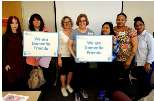
The Dementia Friends session at Jewish Family and Community Services.