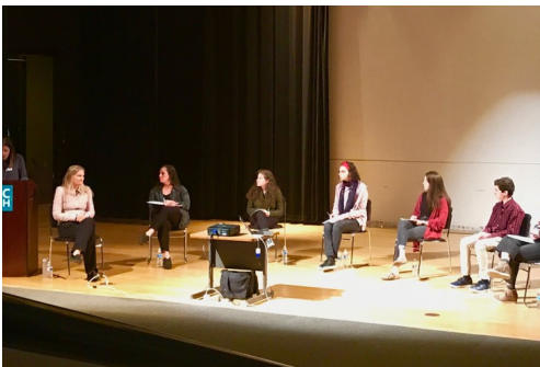
The teen panel at the Community Conversation on Teen Mental Health at the Jewish Community Center.

The 15217 Neighborhood-based Teen Mental Health Initiative, a joint effort of JHF and other Jewish organizations, is giving rise to events even before the initiative begins its work in earnest.