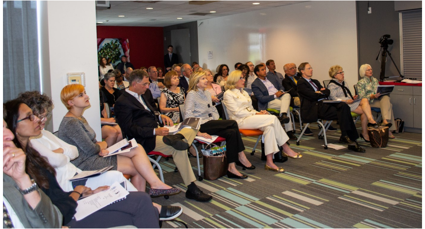
Trustees of the boards of JHF and its operating arms gathered August 26 to hear about Liftoff PGH 2020 and the Advisory Board’s presentation on coming innovations in clinical health care.

“There is no shortage of clinical innovations to study, but the larger point is that the horizon is constantly shifting,” he said. “Health care is making transformative, evolutionary leaps forward. It’s smart of Pittsburgh to build the infrastructure now that will help you make the most of it.”