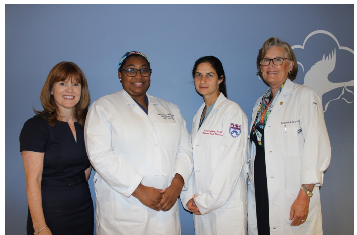
Members of the winning team at Penn Medicine's Hospital of the University of Pennsylvania.

Twenty-nine graduate students and young professionals representing 17 healthcare disciplines participated in the Jewish Healthcare Foundation's (JHF) Patient Safety Fellowship and awarded $20,000 to Penn Medicine's Hospital of the University of Pennsylvania, recognizing their excellence in improving maternal care and addressing racial disparities. Each summer JHF organizes the Patient Safety Fellowship to apply innovative methods and strategies in implementation science, team-based problem-solving, and continuous quality improvement for healthcare settings. This year's focus was excellence in reducing the risk of maternal mortality, offering comprehensive maternity care, and in taking a broad view of "successful" pregnancy.