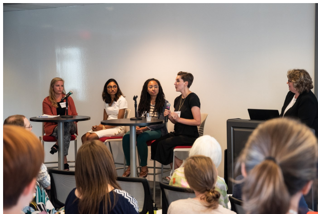
Patient Safety Fellows discuss their experience in the Fellowship at the Finale on July 30.

During the Fellowship, Fellows interviewed and researched the participating sites. The finalists offered such enhancements as new interventions for hypertension, programs for integrating midwives, comprehensive care services for opioid use disorder-affected mothers, staff-lead quality improvement projects, and patient and family engagement. The findings were discussed, shared, and voted on during the Patient Safety Fellowship finale. As a result, the Hospital of the University of Pennsylvania was selected for the Patient Safety Fellowship Award for Perinatal Care.