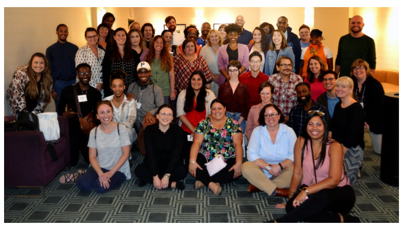
Members of JHF's statewide Minority AIDS Initiative and Southwest PA Ryan White grantees gathered for a combined learning collaborative in Pittsburgh.

Twenty-one staffers from grantees of JHF's statewide Minority AIDS Initiative (MAI) and 28 from Southwest PA Ryan White grantees shared insights and strategies for engaging —